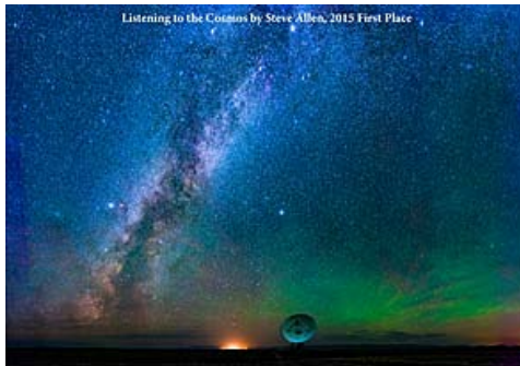
Check out last year's winning photo!

This year the National Museum of Nuclear Science and History will host a Science, Technology, Engineering, Art, and Mathematics (STeAM) themed photo contest. All photo entries must have a subject that relates to the STeAM theme!